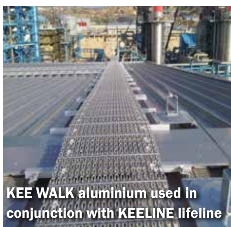
KEE WALK aluminium used in conjunction with KEELINE lifeline

Can be used in conjunction with other products to provide a complete fall protection plan.