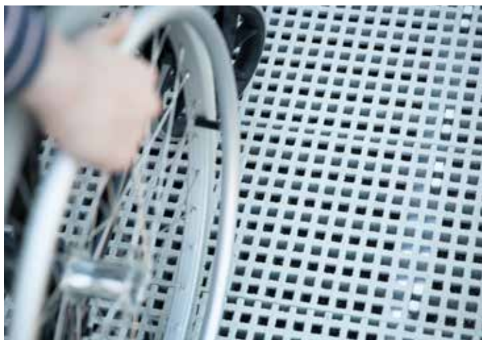
GRP walkway – Anti-slip mini mesh makes the ramp suitable for all weather conditions