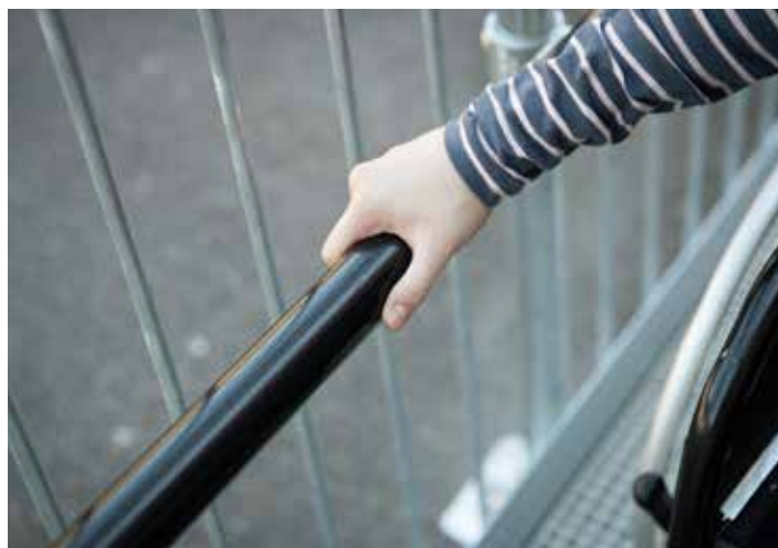
Handrail – Smooth, continuous, powder coated handrail that is not cold to the touch