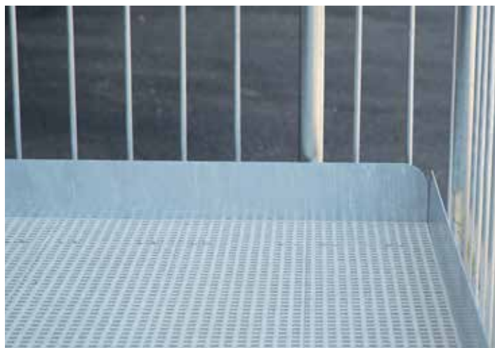
Upstand – Edge guard that guides the user around the access route