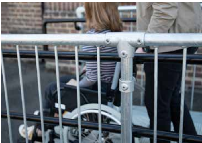
Vertical bar infill panels – Anti-climb, galvanised premium infill panel