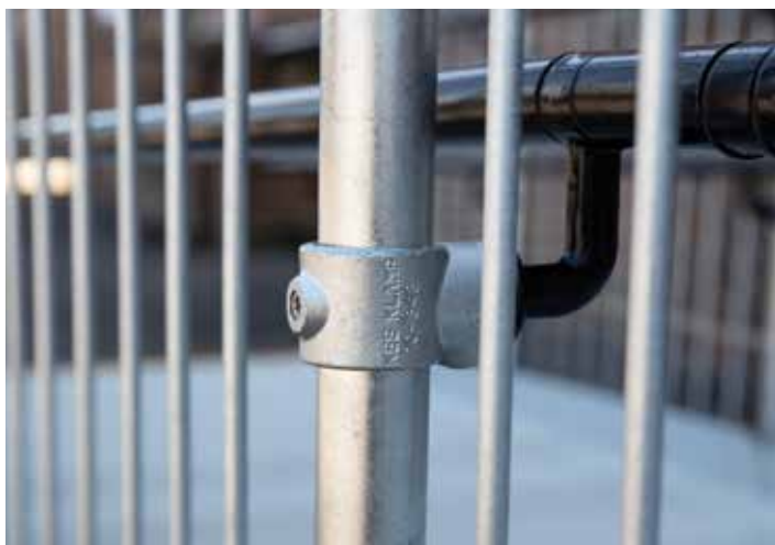
Kee Klamp fittings – Kee Access ramps use tried and tested Kee Klamp fittings for construction