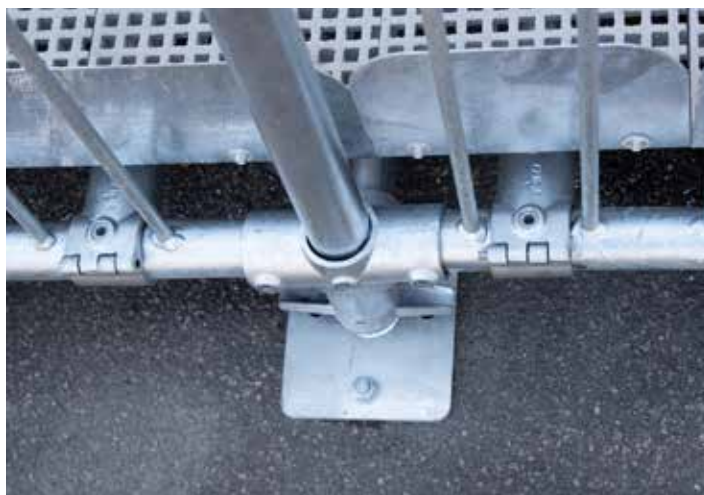
Load bearing feet – adjustable on site to accommodate most substrates